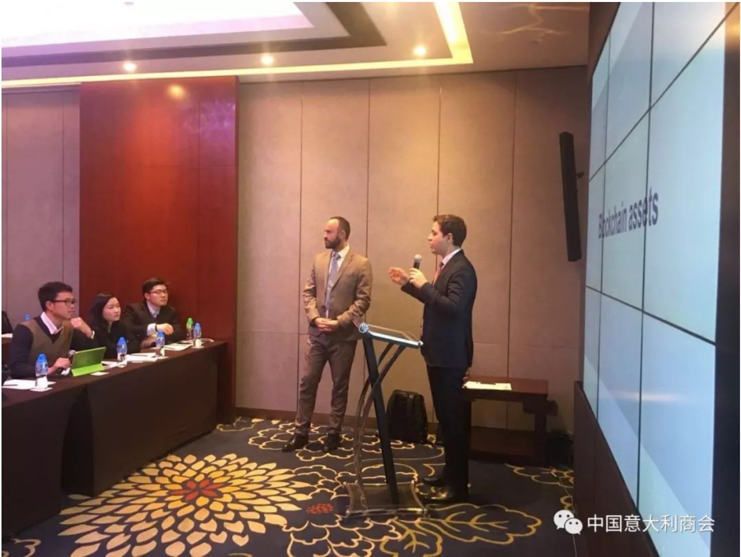
After the speech, during the Q&A session, the guests raised up many questions in an interactive exchange of different points of view with the speakers, which helped to clarify any doubt or curiosity.