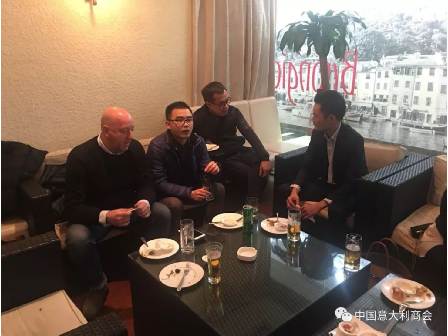
The event was a great success and the CICC would like to thank all participants who attended the seminar and look forward to seeing you in our next edition.